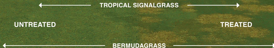
Photo taken October 27, 2017, 14 days after the first application of Manuscript and Adigor at the spot treatment rate. Performance assessments are based upon results or analysis of public information, field observations and/or internal Syngenta evaluations. Trials reflect treatment rates commonly recommended in the marketplace.

Manuscript may be applied to bermudagrass and zoysiagrass on golf courses, sod farms, sport fields, residential properties (including home lawns) and other non-residential turf areas (such as airports, cemeteries, commercial buildings and similar sites ). With Manuscript® , you can get the application flexibility you need to treat mature weeds. It can be used in the heat of summer when desired turfgrass is actively growing, and is formulated with a built-in, proprietary safener to enhance performance and turf safety. Manuscript® is packaged with Adigor™ surfactant from Syngenta, which is custom-built to be used with Manuscript® to maximize the quantity and rate of absorption of pinoxaden, as well as the degree of translocation once pinoxaden is in the plant.